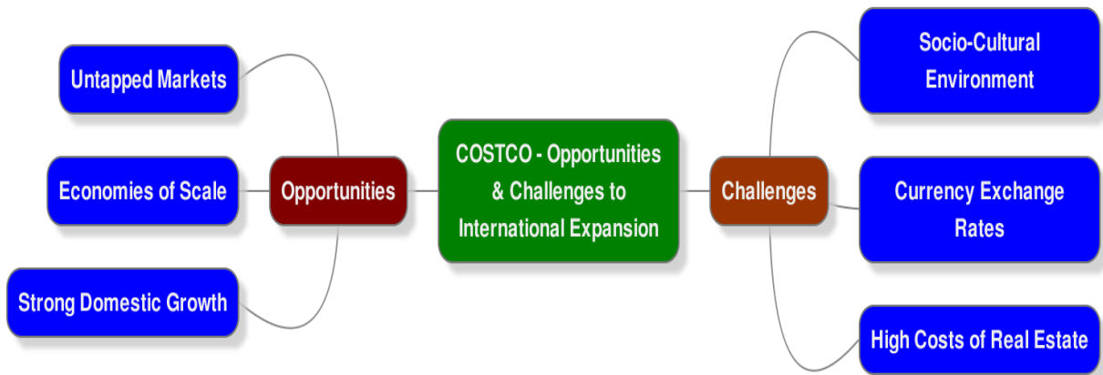
Exhibit B: Opportunities and Challenges to International Expansion